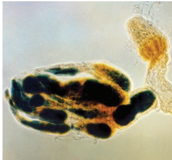
Fig. 2. A pair of ovaries derived from oskar embryos that had received ovarian tumor cells from bam - ;ovo-lacZ + flies. One ovary has no germ cells (the residual \beta -galactosidase activity is due to native Drosophila activity), whereas the other has many ovarioles filled with LacZ + tumor cells, indicating that the transplanted cells had populated the embryonic gonad and formed stem cells in several ovarioles.

mesoderm site for gonad formation, we transplanted wild-type pole cells directly into the dorsal mesoderm of oskar embryos (Table 1). With high frequency, we found that cells transplanted into the dorsal mesoderm were able to successfully establish the germ-line lineage and produce functional gametes. Because some of the donor embryos were probably male, and male pole cells in a female gonad produce tumors (14), the appearance of flies with tumorous ovaries was expected. These transplantations confirmed the earlier result in which pole cells were transplanted into the ventral furrow and indicated that transit through the posterior midgut can be bypassed.